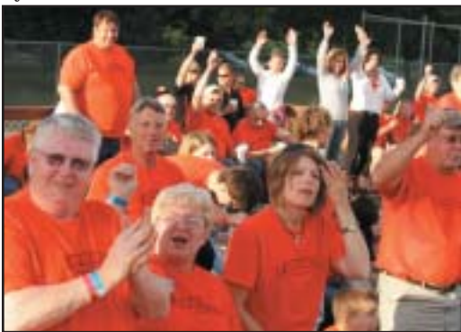
Fans cheer from the Dog Pound in Mankato.

The Mankato MoonDogs had lost that night, but a St. Cloud victory would clinch the MoonDogs' first postseason berth in this 10th season in the organization's history. Finally, a two-run homer in the ninth inning by one of the St. Cloud players allowed the MoonDogs' braintrust to celebrate this long-awaited feat.