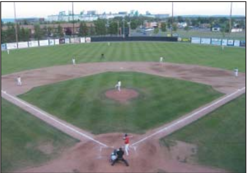
Port Arthur Stadium, Thunder Bay, Ontario, Canada